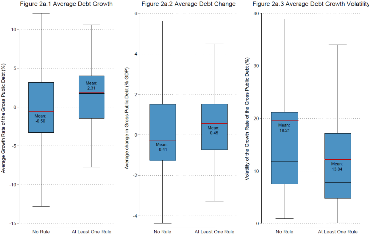
Figure 2a. Fiscal Rules and Debt Performance

Note: Heavily Indebted Poor Countries (HIPCs) are excluded. Only national fiscal rules are analyzed (supranational rules are excluded). Means shown in red.